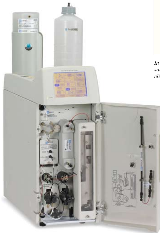
All components are easily accessed through the front chromatography panel.